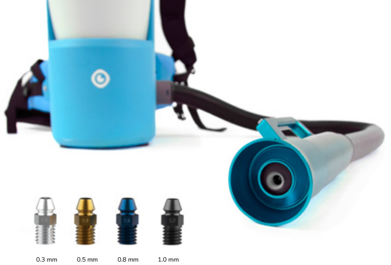
4 different nozzle sizes 20-150 microns

With the interchangeable nozzles you can regulate the mist from 20 to 150 microns droplet size as needed. The mist will float through the air and cover everything it comes across. Ideal for attacking micro-organisms and viruses on surfaces and in the atmosphere.